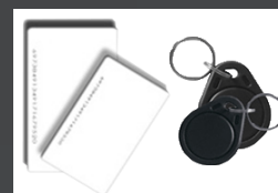
RFID Cards & Tags